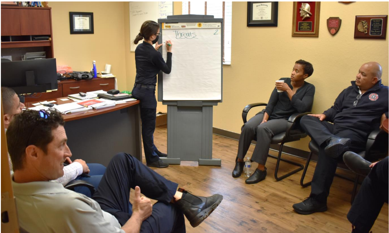
District Stakeholders Work Sessions

Appendix 2 consists of the SWOT data and analysis collected by the district stakeholders.