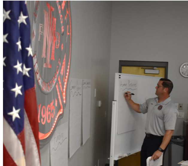
District Stakeholders Work Session

Following the identification and review of the IMFD's SWOT, two separate groups of district stakeholders met to identify themes as primary critical issues and service gaps (found in Appendix 3 ). The critical issues and services gaps identified by the stakeholders provide further guidance toward the identification of the strategic initiatives, which will ultimately lend direction for the development of goals, objectives, critical tasks, and timelines.