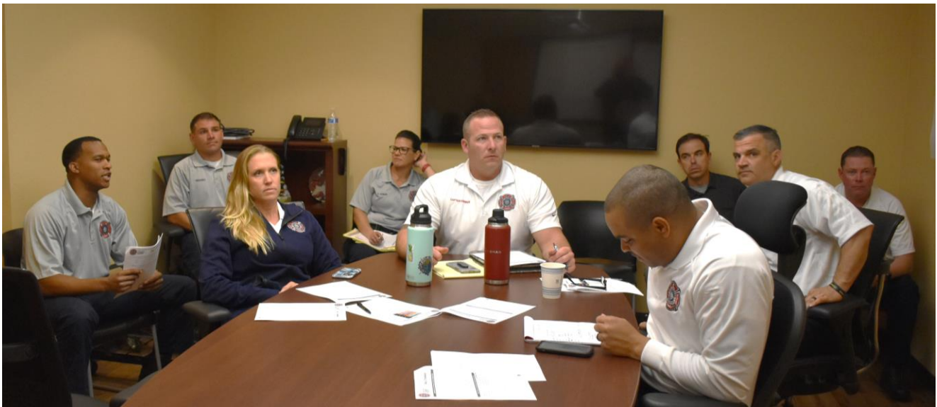
District Stakeholders Work Session

We exist to exceed the expectations of our community by protecting lives and property through exemplary emergency response, community risk reduction, and public outreach.