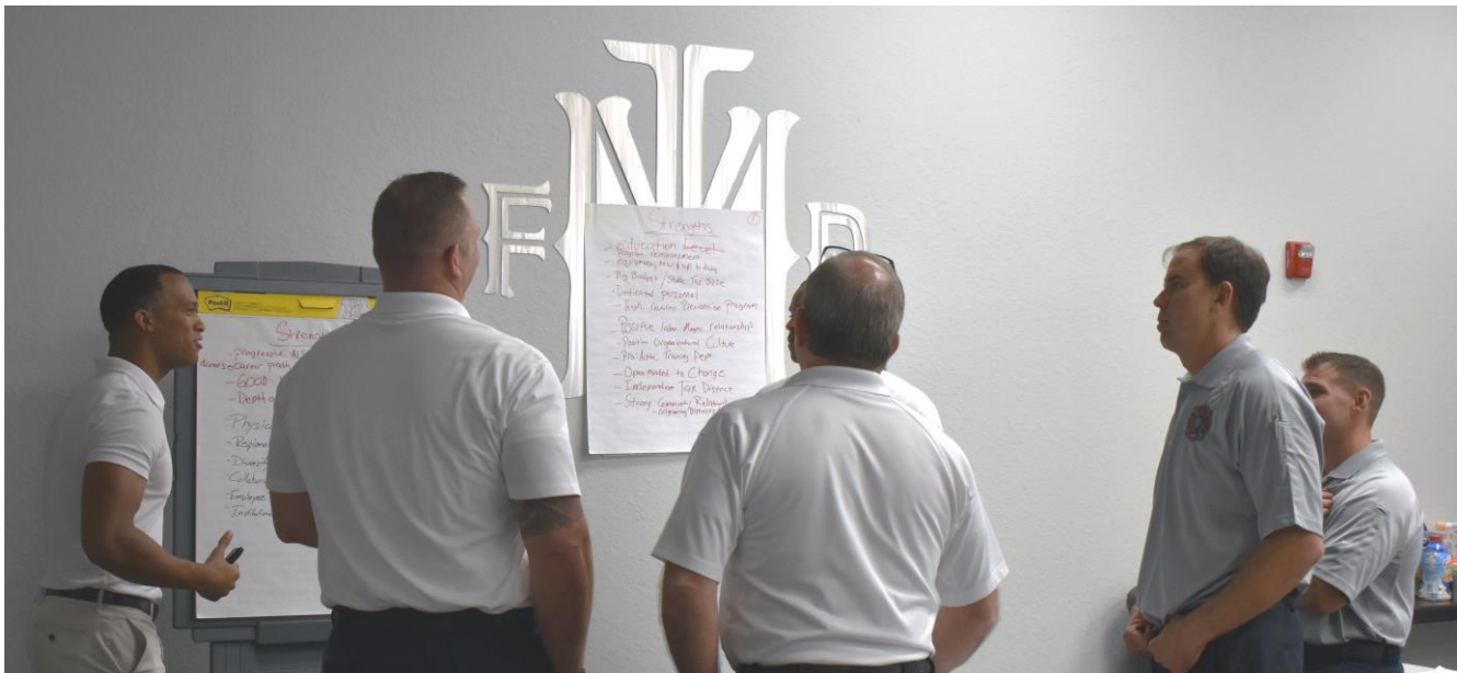
District Stakeholders Work Session

Through a facilitated brainstorming session, the district stakeholders agreed upon the core programs provided to the community and many of the supporting services that support the programs. This session provided the sought understanding of the differences and the important key elements of the delineation.